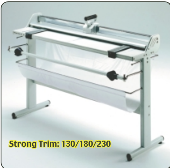
Strong Trim: 130/180/230