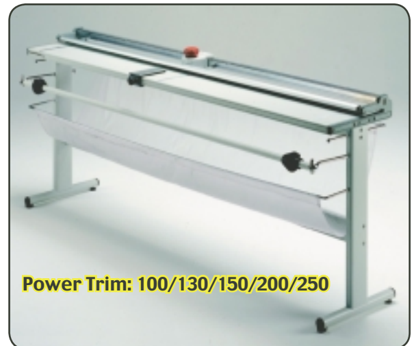
Power Trim: 100/130/150/200/250

Manual cutter with rotary blade mounted on solid steel square bar. Strong frame and solid cutting head makes the Power Trim ideal for trimming laminated medias up to 2mm/5/64". Cuts in both directions and is available in an electric version. Complete with stand and vinyl trim catch tray. Optional accessory: roll holder